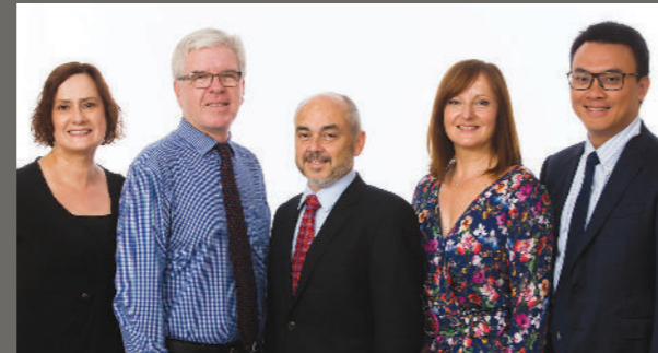
Our Nuclear Medicine Physician Team. Specialised Imaging Excellence.

All of the Specialists are actively involved with the multi-disciplinary teams treating patients across the public/private North Shore campus and provide careful interpretation of images to inform the therapeutic discussions at the multi-disciplinary team meetings. Our images are available across the campus networks and can be accessed instantly for the meeting discussions at both hospitals.